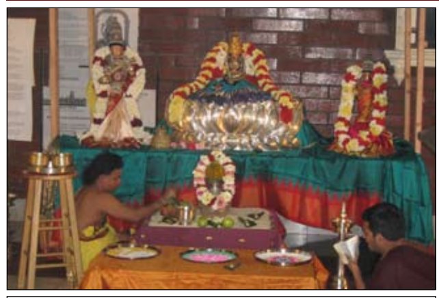
Priests Performing Lakshmi Saraswathi Puja