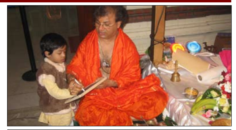
Akshara Abhyasam during Lakshmi Saraswathi Puja